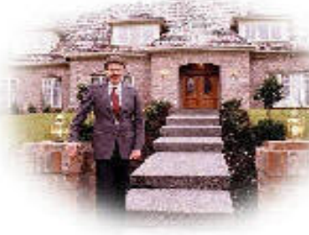
4. Home Selling Success