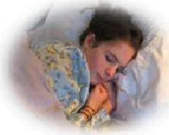
4. Healthy Sleep Solutions