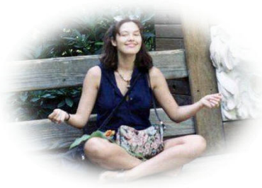
1. Self Help: How To Have It All