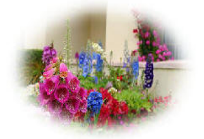
3. Grow A Great Garden