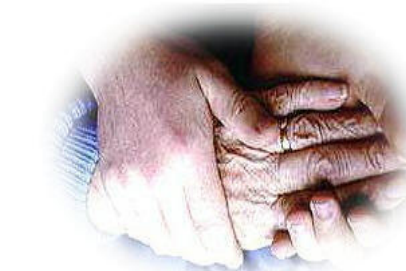
2. Arthritis Treatment Options