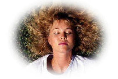
4. Zap Stress Out of Your Life