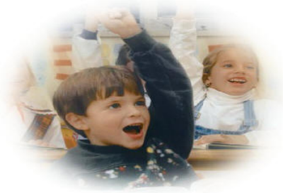
1. Teach Your Children Well