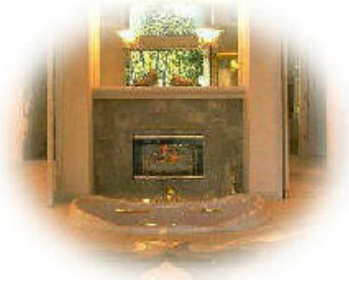
3. Interior Design: The Basics