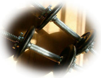
1. Muscle Building Mania