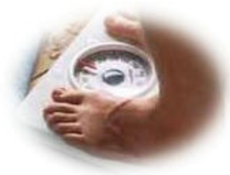
1. Dieting Success Strategies