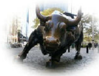
2. Strategies for Investing