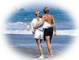
2. Revive Your Relationship