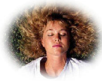
2. Beauty Secrets: Look Younger