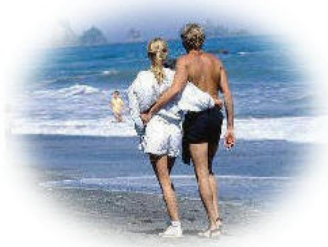
1. Revive Your Relationship