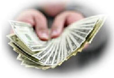
3. Money: Improve Your Credit