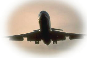
4. Budget Travel Tips