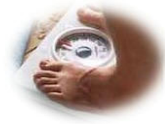
2. The 'Perfect' Diet for YOU