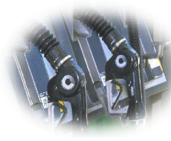
4. Cars Savings: At the Gas Pump