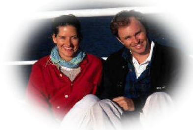
2. Dating: Online Matchmaking