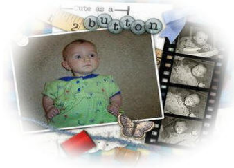
3. Scrapbooking Your Memories