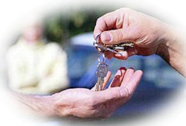
4. Car Buying & Saving Tips

Bear in mind... each of these Premium Niche Packages includes: