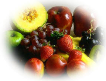
1. Nutrition and Health