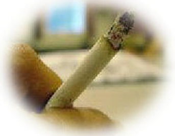
3. Stop Smoking Now