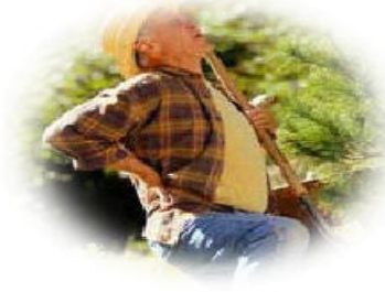
3. Back Pain Remedies