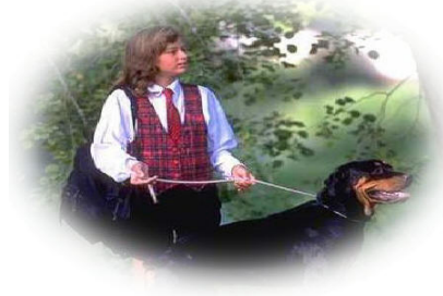
2. Dog Training Tips & Techniques