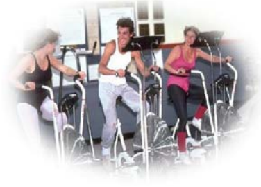
4. How to Get and Stay Fit