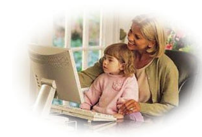
1. Self Employment Solutions