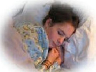
3. Snore Free Sleep Solutions